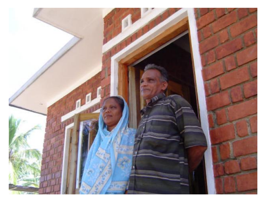
Figure 8:

Collaboration among local authorities, private sector service providers and government organisations in charge of providing basic amenities such as roads, water and electricity is essential in planning housing schemes.