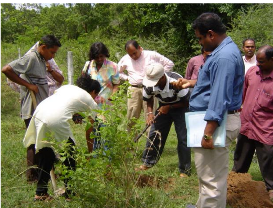
Figure 7: